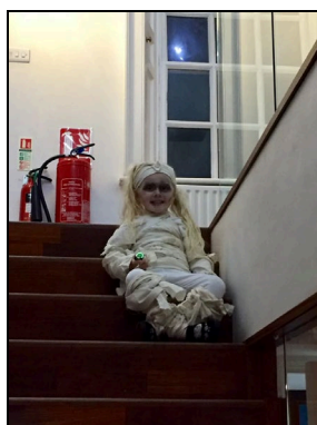
Museums at Night – October 24 th 2019